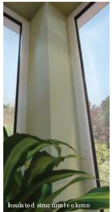
Insulated structural column

A luxurious interior doesn't come more AFFORDABLE than this. We offer you a range of design options, each giving you the ability to improve the look and thermal performance of your home extension.