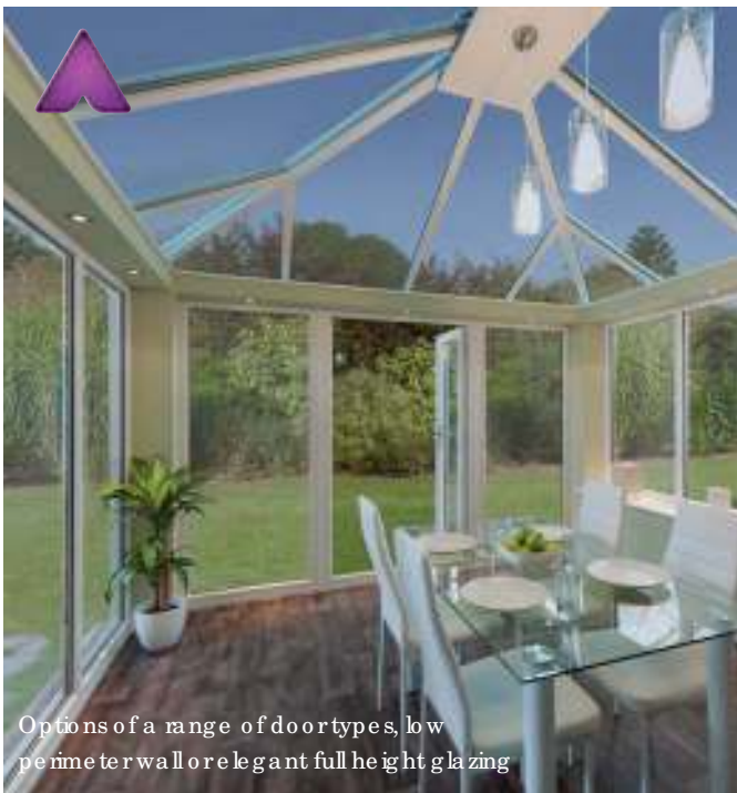
Options of a range of door types, low perimeter wall or elegant full height glazing

Great value, great looks. With Loggia Prestige the choice is definitely yours